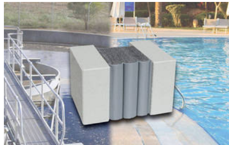
Expansion Joint Sealant is chemical-resistant and watertight.

contact with chemicals and chemical dilutions is expected. It is composed of nonstaining, microsphere-modified-acrylic-impregnated foam backing, which is precoated with chemical-resistant polysulfide sealant. Able to resist water pressure of up to 5 ft without product deflection or leakage, sealant is suited for submerged or intermittent-contact applications.